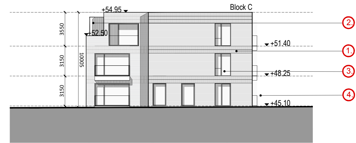
WEST ELEVATION Scale: 1/200