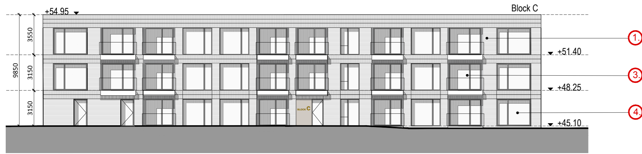
SOUTH ELEVATION Scale: 1/200