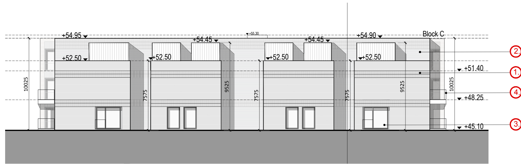
NORTH ELEVATION Scale: 1/200